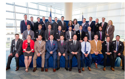
Pictured: Group 22, THF Virginia Beach Campus

June 3 marks Day 1 of our virtual cohort! The course content delivered at our San Diego, Virginia Beach and Camp Lejeune campuses is now delivered live in virtual across the globe! Stay tuned for more details on Fellows of Group 24!