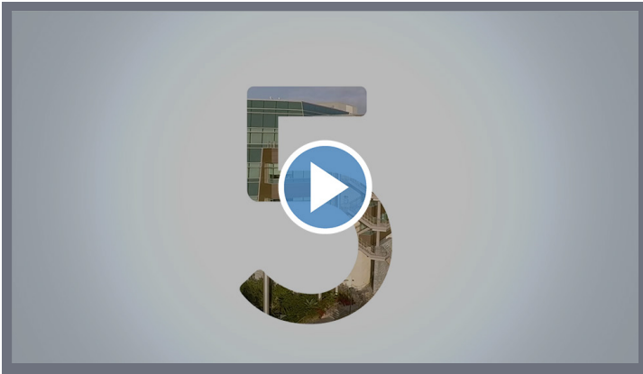
Click on the Thumbnail above to play the video.

On June 27, 2019, The Honor Foundation will celebrate its 5-Year Anniversary and we could not be more proud of where we are today.